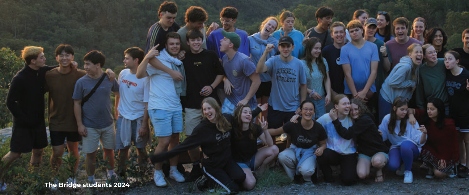
The Bridge students 2024

D eveloped to provide a gap year program for 18- to 21-year-old Christians centred on the Bible and missions focussed, The Bridge has equipped over 300 students for a lifetime of following Jesus.